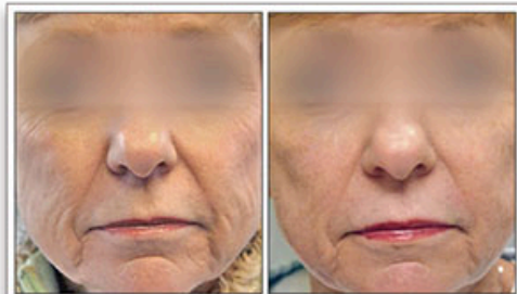
4 Weeks Post 1 Treatment