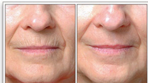
4 Months Post 1 Treatment