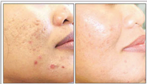
Post 3 Treatments